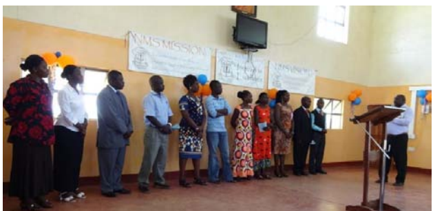
Our newly formed Parent-Teacher Association

Besides academic rigor, the learners will this year participate in enrichment activities such as drama, music and sports competing with other schools in the region. A newly commissioned Parent-Teacher Association of 13 will provide input to school administration and act as a liaison with the local community.